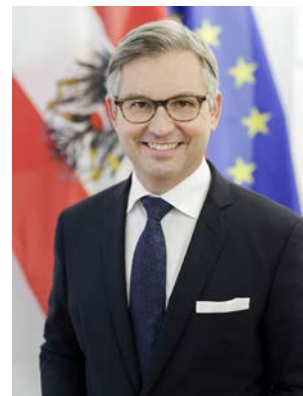
Your Finance Minister Dr. Magnus Brunner