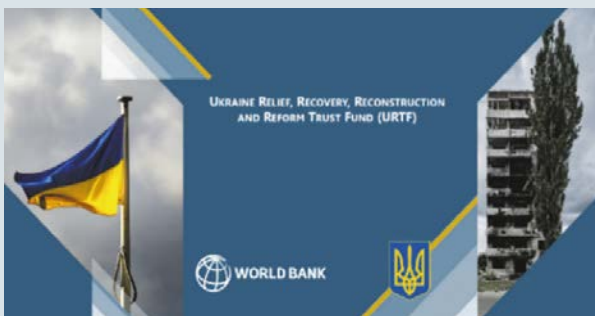
Ukraine Relief, Recovery, Reconstruction and Reform Trust Fund

The URTF was presented at the IMF/World Bank Annual Meetings in October 2022 against the backdrop of the dramatic consequences of the Russian war of aggression in Ukraine and was supported by Austria with a contribution of 20 EUR million in December 2022. It is part of a World Bank Group support platform for Ukraine, which mobilizes financial resources from public and private donor countries and is to be implemented jointly by the WB