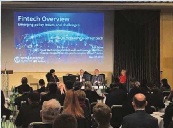
Panel Discussion FinSAC Conference 2019

FinSAC, based in Vienna, is a technical unit of the World Bank that provides advisory services and support for the implementation of financial sector reforms in Europe and Central Asia (ECA). The center has been supported by Austria since 2011.