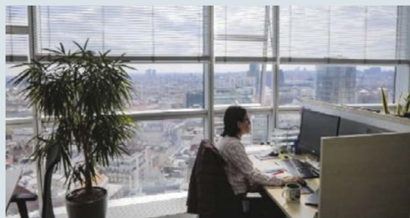
Vienna office of the World Bank

The total capacity of the Vienna office is approximately 290 staff and consultants (as of 2023).