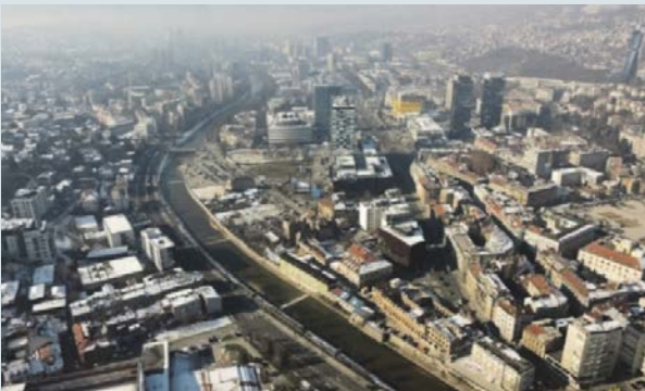
Urban development area in Sarajevo

Austria and the EBRD have established the CREATE (City Regeneration and Environment) Fund, to support cities in promoting public and private investment in city centers. Sarajevo wants to develop new urban centers within the existing urban fabric. This will improve access to jobs and housing, reduce traffic congestion in the old city, and attract investment in sustainable real estate and greener public spaces.