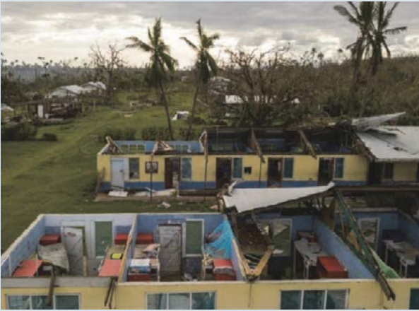
Vanuatu: Aftermath of Tropical Cyclone Harold

The World Bank's GFDRR is a global partnership, that helps developing countries cope with natural disasters and adapt to climate change through grants, technical assistance, analytical support and training. Integrating disaster and climate risk management into policies and strategies is essential. GFDRR's activities support the Sendai Framework Agreement, the Paris Climate Agreement and the SDGs.