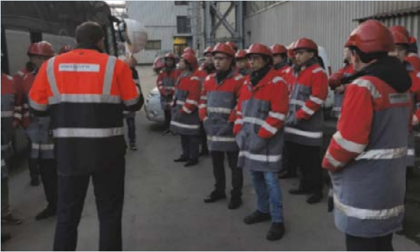
Company visit in Austria with Azerbaijani participants

Parts of Azerbaijan's rail network are in poor condition, resulting in high costs/prices, long travel times, and a lack of safety. This is a clear disadvantage for the country's competitiveness. The AsDB is therefore supporting Azerbaijan in modernizing the state rail network and making its management more sustainable in order to optimize usage and costs. One aspect is the use of digital technologies that enable preventive maintenance to avoid breakdowns.